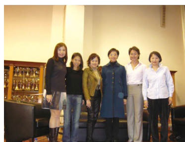
Guest speakers with our hosts.