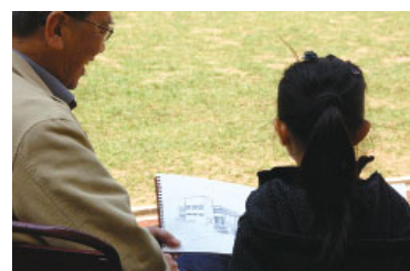
Father and daughter sketching a facade of the school.