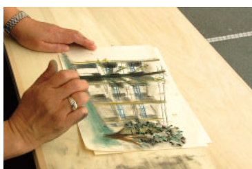
This must be the Gibbons Block!

Before the decanting of both the Junior School and the Senior School from 1 Jordan Road, Art Club members participated in the last Art Club activity held on our familiar campus – ‘Sketch Your School’. With pencils, papers, water colour and pastels on hand, our old girls enjoyed sketching their favorite part of the school, and took home their own artistic renderings of our beloved school.