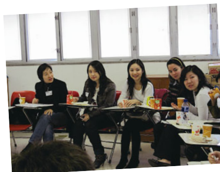
Support from the younger class representatives!

In addition to being briefed on major events such as the Farewell Service on March 26th, 2009 and the ongoing Mentoring Program, participants were updated on the School Redevelopment Program and on alumnae giving opportunities to the school's fundraising campaign.