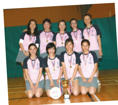
Our winning team this year at Division 2!