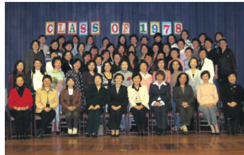
30th reunion class photo of class of 1978 taken in March 2008