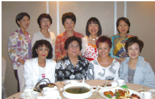
Class reunion gathering of class of 1966 in September 2007

Participation rate – In the experience of the class reps, getting as many classmates as possible to participate is equally, if not more important than the amount they get. The class reps all emphasized that they did not wish classmates to feel any undue pressure and that amounts given were kept confidential. Of all the class gifts set up currently, the class of 1978 would take the prize, if there was one, of the class with the best participation rate. So far, 52 of their classmates have given.