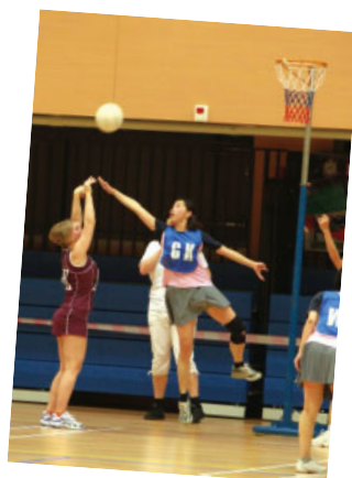
Good defense from our team!