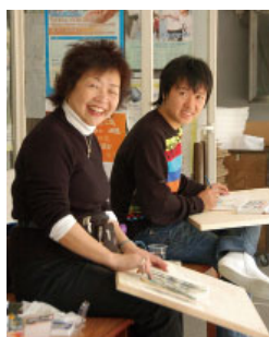
Having fun putting their images on paper!