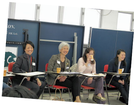
A relaxed and happy atmosphere of sharing...

Class representatives met at the 6/F student activities room, DGJS to chat with DOGA General Committee members, mentors, mentees and new members on March 14th.