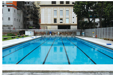
The swimming pool where our swimming classes were held