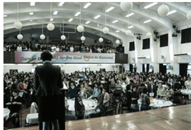
The Senior Hall with the buzz of excitement where concerts and school productions were held