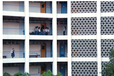
The Senior School balcony...glorious moments of school spirit and unity