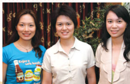
And from the Lai sisters and sister-in-law as well